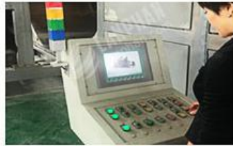
automatic equipment control