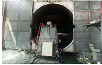
large whole shaping machine