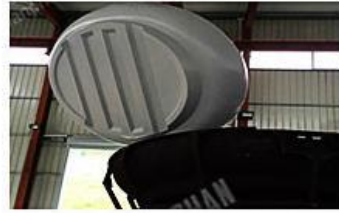
seamless and no stitching